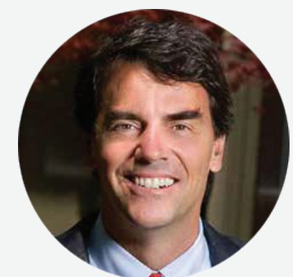
Tim Draper Founder